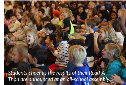
Students cheer as the results of their Read-A-Thon are announced at an all-school assembly.

Renbrook students recently joined the distinguished and dedicated ranks of Take Flight donors. From September 26 to October 10, during the Take Flight Read-A-Thon, 207 students logged 72,676 minutes read and raised $30,729 for Take Flight and the reimagined library! At a special assembly on October 13, students, faculty, and staff gathered in Stedman Auditorium to celebrate our students' teamwork, reading, and fundraising. We acknowledged top readers and fundraisers, heard from Head of School Matt Sigrist about what Take Flight and our students' philanthropy mean to our school, and cheered along to a video featuring favorite moments from the Read-A-Thon. We are truly blown away by our students' efforts and our community's support, and we are proud to announce: Mission accomplished!