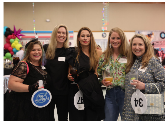
Parents "danced through the decades" and rocked the paddle raise at Celebrate Renbrook!