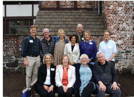
The Class of 1973 celebrated their 50th reunion during Alumni Night 2023!