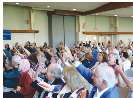
Guests waved to their students at Grandparents & Great Friends Day.